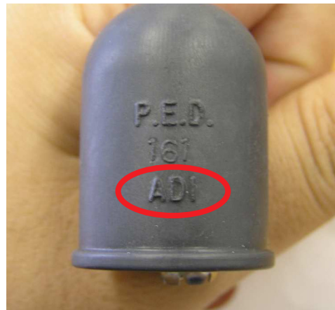
Old Style (ADI)