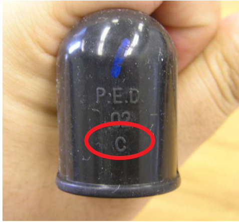
New Style (C)

The high tension cables for Impreza and Forester have changed to a silicone rubber boot which has a shiny appearance. Please note that the part numbers have not changed. The Legacy and Outback high tension cables also have a silicone rubber boot.